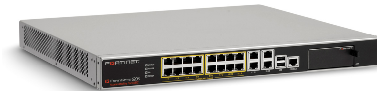
Fortigate-620B Base Unit

The FortiGate-620B answers the call of growing enterprise networks by integrating a purpose-built security processing ASIC, known as the FortiASIC Network Processor, designed to deliver security throughput at switching speeds. Sixteen hardware accelerated interfaces (expandable to 20) allow networks to enforce firewall policy between network segmentation points for layered security with switch-like performance. An additional purpose-built ASIC, known as the FortiASIC Content Processor, provides additional acceleration for content intensive security technologies such as intrusion prevention and antivirus scanning for dangerous traffic streams. The inclusion of an Advanced Mezzanine Card (AMC) expansion slot allows for even more flexibility, offering additional ASIC-accelerated ports for additional throughput or disk-based storage for local logging and content archiving. With numerous accelerated multi-threat security interfaces, organizations can create multiple security zones for various departments, users, access methods, and even devices to enforce network security at accelerated speeds.